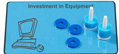
A pic of a small part of one of our games

We can also review internal accounts and performance reports