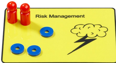
A pic of a small part of one of our games

“The trainers were some of the best I have ever encountered”*