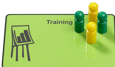
A pic of a small part of one of our games

Running a successful business depends on proper control of the key resources, directing staff time, innovating, planning and co-ordinating