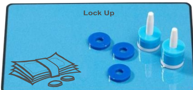
A pic of a small part of one of our games