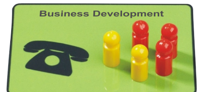
A pic of a small part of one of our games

The Business Experience incorporates your key course objectives and brings them to life