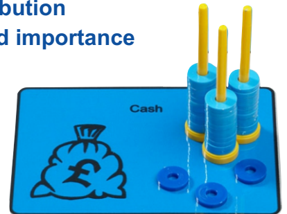
A pic of a small part of one of our games